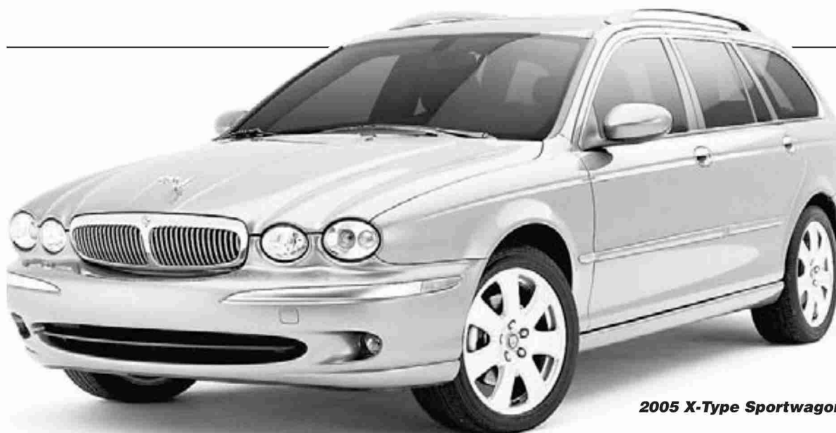
2005 X-Type Sportwagon