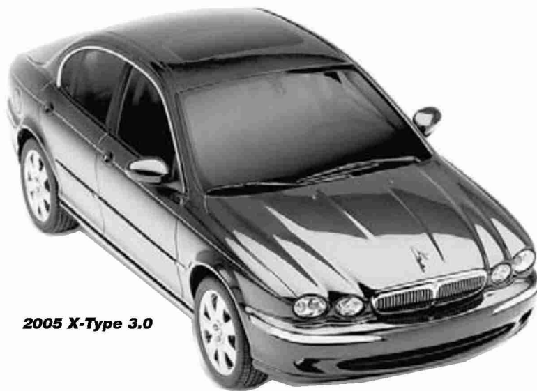
2005 X-Type 3.0

EPA Fuel Economy — City: 18 Highway: 25 – 28 Kelley Blue Book Retail Value — $21,000 – $25,800 – Jim Flammang for Cars.com